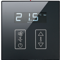
Touch Control Thermostat