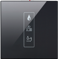
3 Input Touch Control Panel