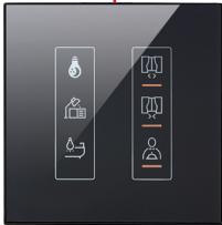
6 Input Touch Control Panel