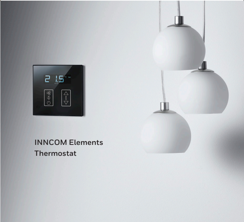
INNCOM Elements Thermostat

The Elements thermostat is a beautifully-designed intelligent programmable thermostat providing as much functional flexibility as it does design. It wakes at the first touch and easily allows the guest see the current temperature and adjust the temperature as they wish. When coupled with one or more a occupancy sensors it creates a room-level energy management system (EMS) and will automatically set back the comfort level when the room is unoccupied resulting in significant energy savings for your business.