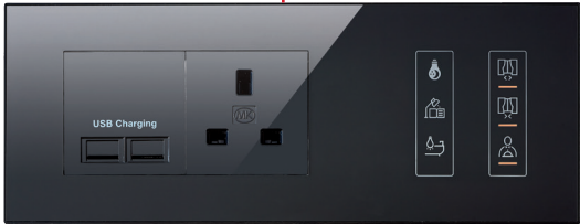
Combination Power and Control Plate

Elements features a design language that unifies products from the INNCOM and MK Electric portfolios and offers a single solution for the forward-thinking hotelier. All the products across the range feature the same contemporary design and slim profile, which include switches, sockets, and electronic touch interfaces for hotel guest room controls, inspired by materials such as metal and glass.