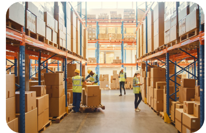
Manufacturing units & Warehouses